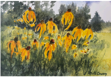
In the Meadow