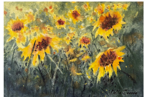
Burst of Sunshine

Please indicate on the line in the left column the number you wish to order. You can use the right column to figure the total if you wish.